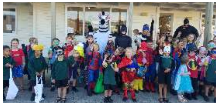
Here are some of our Walking School Bus Super Heroes

146 students walked to school today - which is fantastic and what a lovely morning it was for a brisk walk! Thanks to everyone who encouraged their children to take part. We hope they enjoyed it. Perhaps it could become a regular occurrence for them?